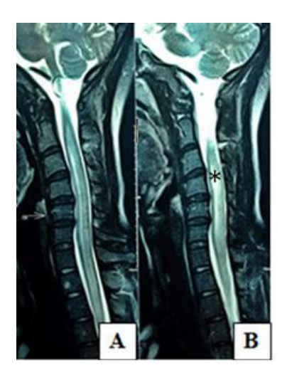
Fig 1. A,B Idiopathic Syringomyelia on T2WI MRI (asterisk)