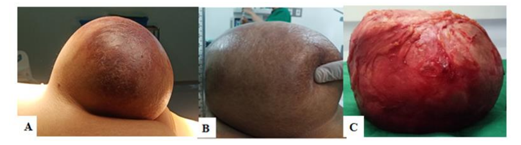
Figure 2 A. Lateral View; B. Superior View Before Surgery; C. Macroscopic Mass After Surgery Size 20x18x16 cm Solid and Capsulated