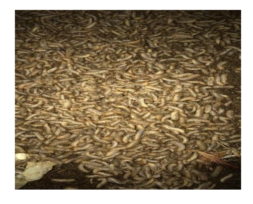
Fig. 5. Results of the maggot cultivation for catfish feed by Karang Taruna Bulu