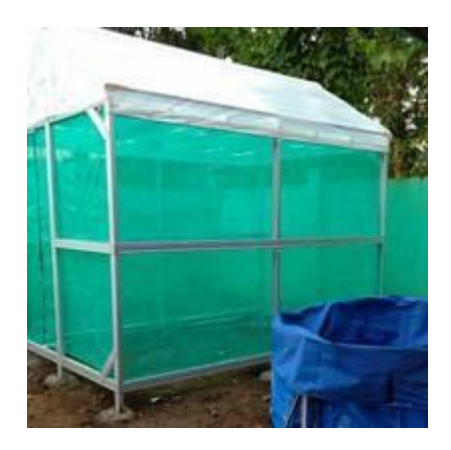
Fig. 4. BSF Cage made of HDPE plastic mesh

Karang Taruna Padukuhan Bulu managed to build 3 plots of maggot or biopond cages (Figure 4), as well as 1 plot of maggot breeding lair, made of wood and HDPE plastic mesh with a size of 1.5 m x 2 m with a height of 2 meters and a roof made of asbestos and fiberglass, while the maggot enlargement cage (biopond) is made with a size of 1m x 2 m with 20 cm deep. The practice of maggot cultivation begins with 7-day-old baby maggots that are put in a biopond cage and kept for 12-21 days. As a medium or maggot feed, household waste and chicken egg waste from the chicken factory in Kapenewon Semanu are used, which are taken free of charge. The results of cultivating maggots with 5 grams of maggot eggs, after being hatched and raised into larvae, produced 20 kg of maggot larvae. with a maintenance period of 12 days in a biopond (Figure 5). Maggot is directly given to catfish ponds as animal feed, with a ratio of 30% maggot and 70% commercial feed.