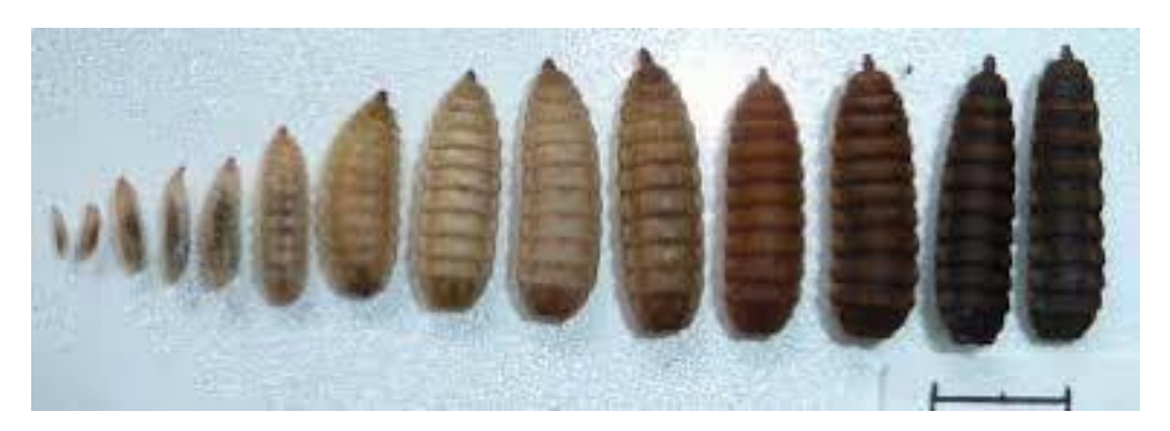
Fig. 3. Development of BSF (Makhrojan, 2018)

Figure 2 shows the development time of BSF in each stage of its metamorphosis seen in days. Adult BSF flies lay their eggs near food sources. Maggot has 5 instars in its development and can grow up to 20 mm (Figure 3), pupae migrate to a more humid place to then grow into adult flies.