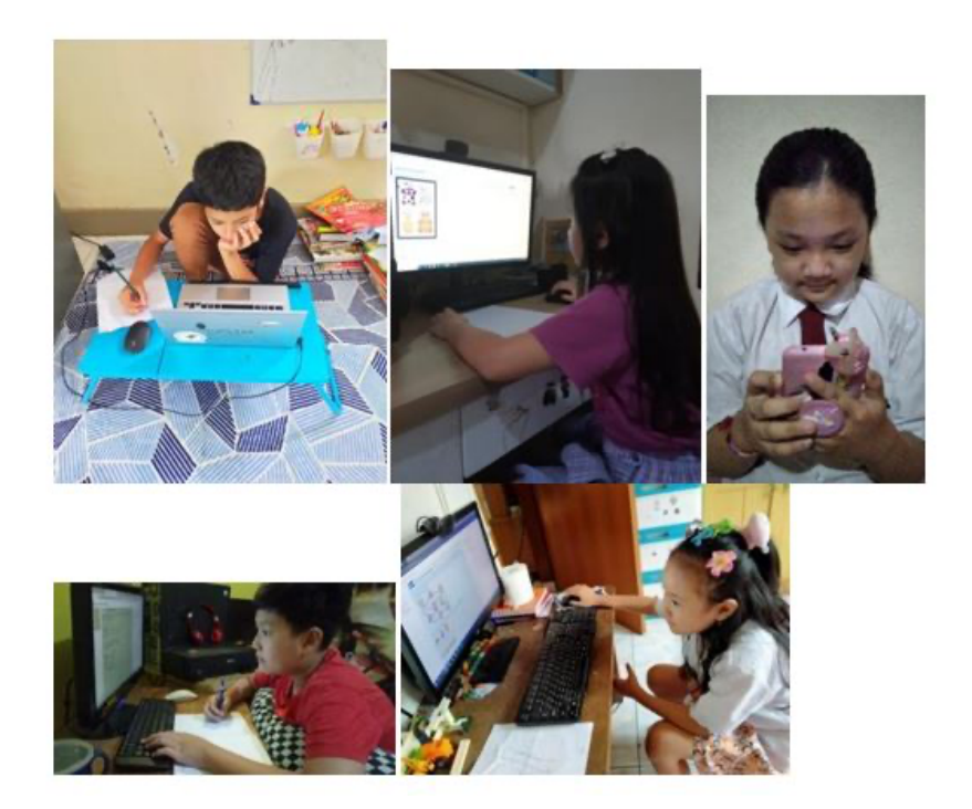
Fig. 4. Online Bebras Challenge for elementary school

In addition to limitation of telecommunication infrastructures in Indonesia or tools used by the participants, Bebras Indonesia opened exceptions reporting at the time of the contest. The exceptions may be power outages or internet disturbance. In exceptional cases, students or parents (for elementary school) could report to the teacher. The teacher delivered the report to the mentor. The mentor sent the report to the coordinator. The coordinator reported the cases to Bebras Indonesia. The communication was done through chats via WhatsApp group, calls, or emails. The participants, which encountered the exception were recorded. On 13 November 2020, after the challenge was finished, the contest committee evaluated the cases and decided the way out. The committee gave an opportunity to the participants of the cases to redo the contest in certain schedules.