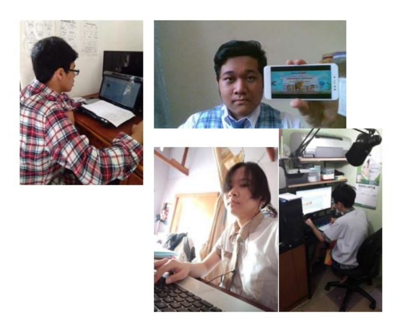
Fig. 5. Online Bebras Challenge for junior and senior high school.

Table 2 shows information about contest participants' distribution in the Maranatha Bebras Bureau. Total participants were 1,740, with 190 students in junior elementary school (11%), 338 students in senior elementary school (19%), 918 students in junior high school (53%), and 294 students in senior high school (17%). The order from the most to the least number of participants were junior high school, elementary school, and senior high school. Based on gender, male participants were 52 % and female participants were 48 %. Elementary school participants were from 24 schools, where 13 schools have followed the Bebras Challenge from the previous year, and 11 new schools. Junior high school participants were from 18 schools, while senior high schools from 19 schools with 6 new schools.