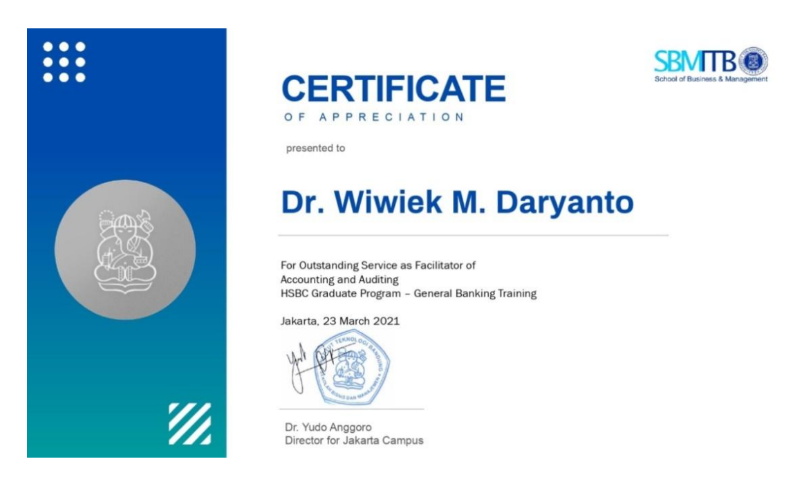
Fig. 4. Certificate as a facilitator

The facilitator also received a certificate as a token of appreciation from the organizers, as shown in Figure 4.