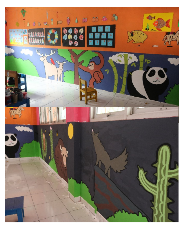
Fig. 10 Final results of the mural painting