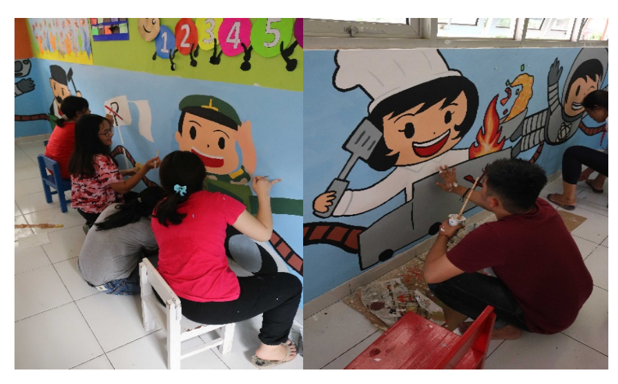
Fig. 7. Mural painting process

The mural painting was done within three days by the multi-disiplinary students from Universitas Kristen Maranatha, Bandung. The patterns had painted with a very good accomplishment and clearly.