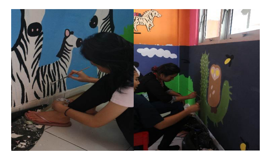
Fig. 8. Finishing detail process

The students painted the detail as well as cleaned the area, hence, the classroom can be used for teaching and learning in the following day.