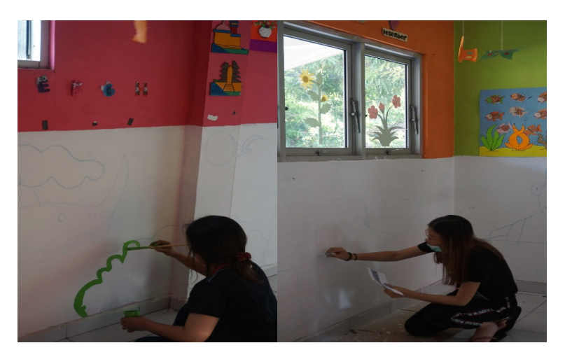
Fig. 5. Mural preparation process

This was the stage that all participants in the community service awaited. The stage started with sketching the white coated wall using the design sketch from the stage II as the reference of the mural painting.