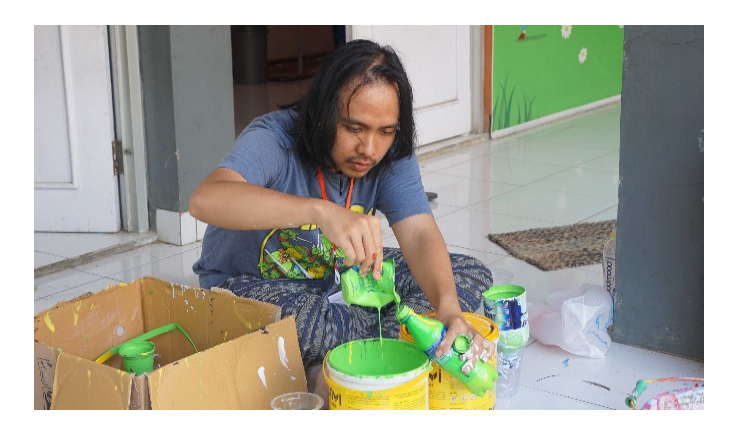
Fig. 6. Preparation of the wall paint

This stage also included painting the wall with wall paint as the main coating that prepared before and after the painting accomplished in the wall. The mural used the bright colour, since the colour was the important element to create comfortable atmosphere and to influence the psychology of the residents (Indraswara, 2007).