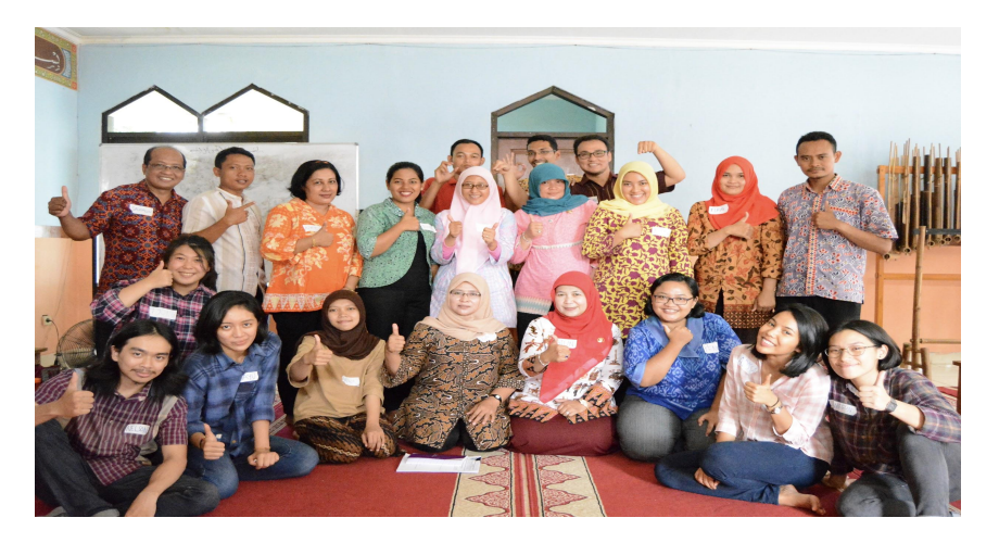
Fig. 3. Training on "The Golden Ways" on the third day with caregivers from PSAA Putra Utama 03 Ceger as Participants.

The discussion on learned optimism material was also limited by time. At the time of preparation, this training material was prepared by considering a lot of applicative discussion of the material, but it could not be done because of limited time.