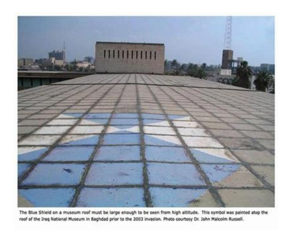
Figure 10. Kato Paphos Site, Cyprus.

Placement of the Blue Shield Emblem is considered difficult to place in a suitable and visible place. The installed emblem must not be placed in any way that may pose a risk of infringement or damage to the authenticity of the cultural heritage site. Just as in Figure 10 which places the Blue Shield Emblem on a roof, the placement of the Blue Shield Emblem was also carried out at the Kato Paphos Site in Cyprus, a site that has a circumference of 5 km so that it places the symbol on the roof of the conservation laboratory. Placement in this way is intended so that the size of the Blue Shield Emblem is large enough to be seen from the air. To Uniformity regarding sizes