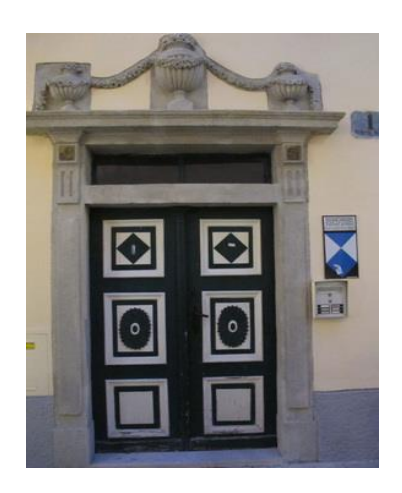
Figure 9. Historic Buildings in Wiener Neustadt, Austria.