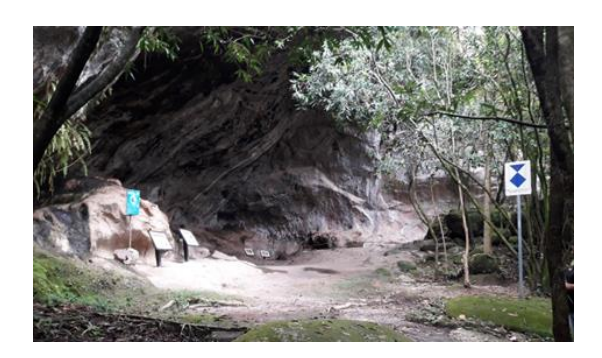
Figure 7. Blue Shield Emblem in the Holy Cave (Corint Cave), El Salvador.