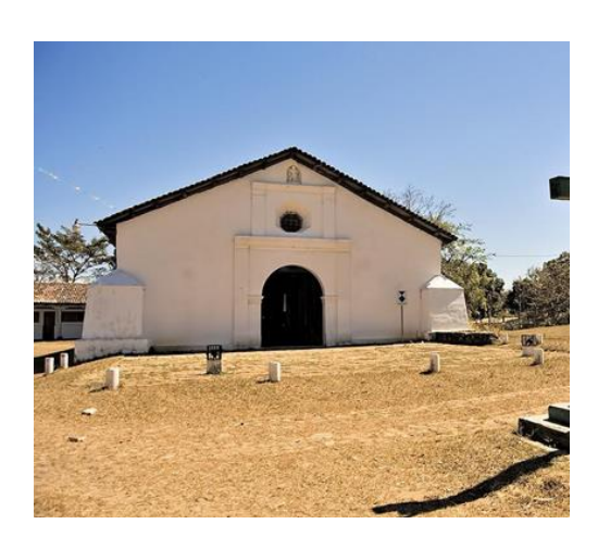
Figure 6. Blue Shield Emblem in San Miguel Arcángel Parish, El Salvador.