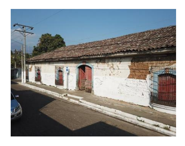
Figure 8. Blue Shield Emblem in Barrientos Family House, El Salvador. ^{72}